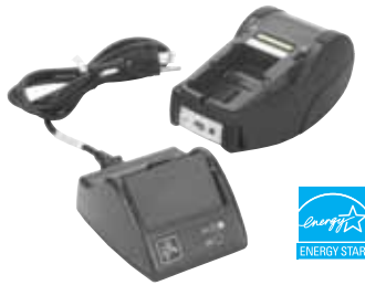
Shown with printer for reference purposes; printer is not included

The smart charger will fully charge a single standalone QLn smart battery in less than four hours. In addition to indicating battery charge status, it indicates battery health, allowing you to more accurately manage your spare battery pool. Specifically, LEDs show whether the battery is "good," has a "diminished capacity," is "past useful life," or is "unusable" and should be replaced. The smart charger comes with a charging base and power cable.