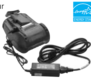
Shown with printer for reference purposes; printer is not included

Connect the AC adaptor to your QLn printer and mains socket to charge the printer's smart battery whilst in the printer. The printer can print labels and perform other functions during charging.