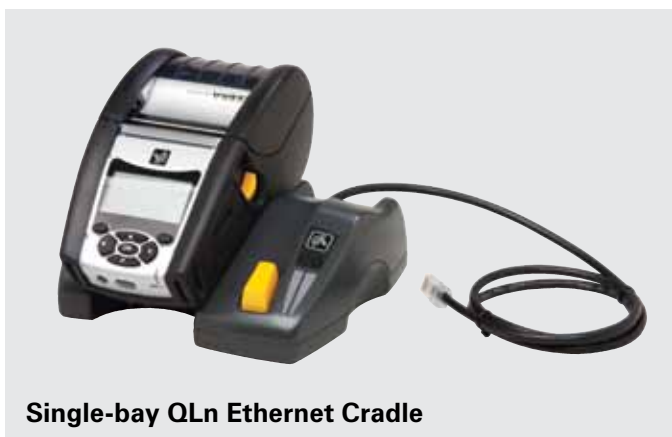
Single-bay QLn Ethernet Cradle