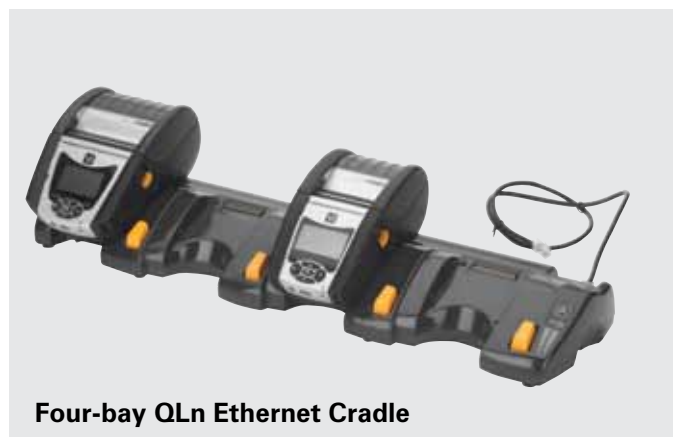
Four-bay QLn Ethernet Cradle