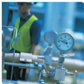
Field Force Automation